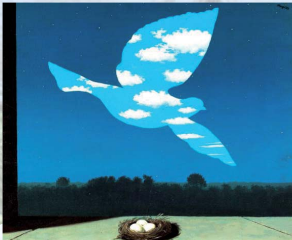
Le retour, 1940, Huile sur toile, 55 x 65 cm, Musées royaux des Beaux-Arts de Belgique, Bruxelles, © ADAGP, Paris 2008

May 2009 of the museum dedicated to the great master in Brussels.