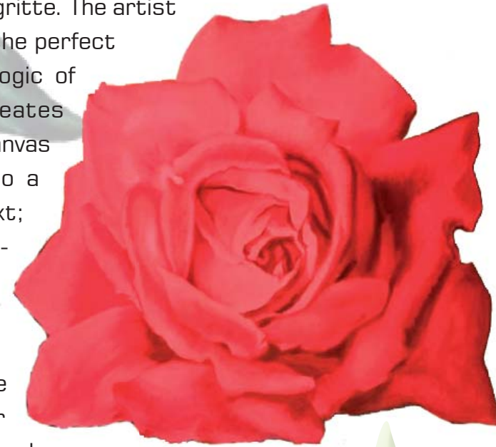
Le tombeau des lutteurs, 1960, Huile sur toile, 89 x 116 cm, Collection privée, Bologna, © ADAGP, Paris 2008

Mystery and Nature are the keywords that depict the artistic universe of Magritte. The artist considers mystery as the perfect tool to question the logic of commonplaces: he creates known objects on the canvas transferring them into a new and unusual context; while nature is ever-present in his artistic work since, according to him "... it creates the dreamlike state which brings to our body and spirit the freedom they need". Magritte's words follow visitors along and, as the only written comment, describe and narrate his masterpieces.