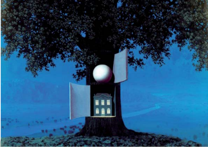
La voix du sang, 1961, Huile sur toile, 90 x 110 cm, Collection privée, Bruxelles, © René Magritte by SIAE 2008