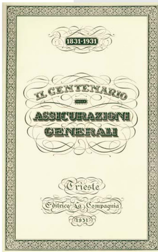
1 Il centenario delle Assicurazioni Generali 1831-1931, Trieste, la Compagnia (1931)

The collection naturally includes many titles associated with Trieste, once the emporium of the Hapsburg empire, such as the two volumes of Lloyd Triestino, one of the oldest shipping companies in the world, founded in 1836 as a branch of Lloyd Austriaco now called Italia Marittima, entitled Lloyd triestino, 1836-1936: contributo alla storia italiana della navigazione marittima and Il Lloyd Triestino, 1936-1986: contributi alla storia del cinquantennio and the volume published by RAS to mark the first centenary of its foundation: Nel primo centenario della Riunione Adriatica di Sicurtà 1838-1938 (fig. 2).