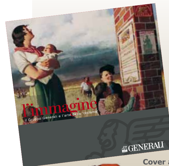
Cover and detail of the book