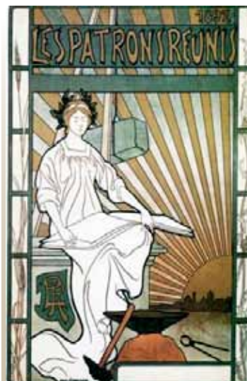
poster Les Patron Réunis (P. Verdussen, 1897)

Still on a similar topic - Generali's presence in Rome at Vittoriano within the 150 th Italy's celebrations - a further dedicated section will soon be published.