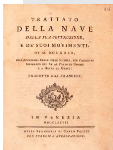
2 Trattato della nave ... di Pierre Bouguer , Venezia, C. Palese (1777) (photo C. Tommasini)